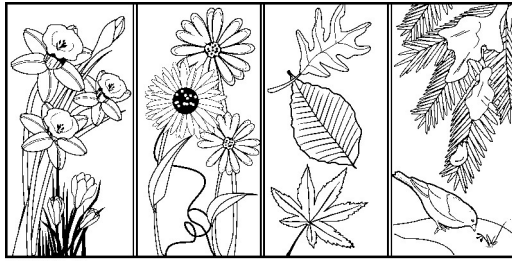
C. J. S. Pflanz Co., Inc.