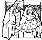
and was filled with wisdom